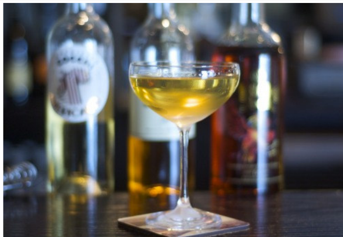
The Bird Bath

Stir with ice and strain into a coupe glass.